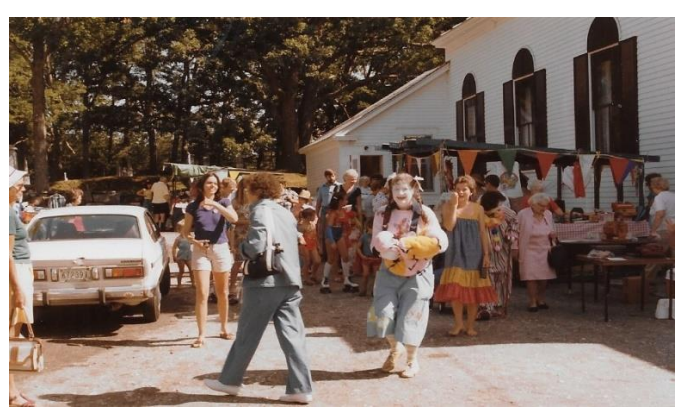
BWC Street Fair, c. 1983

Years ago, the BHS was given many items from the Bradford Women's Club. The Bradford Women's Club (BWC) was a very important organization in our town for many years. When reviewing some items, I found many "Programs" for events. The Women's Club sold these Programs for 10 cents at their street fairs and Annual Fairs to all that attended. In one of the Annual Fair Programs of August 8, 1945, was an article called "BRIEF HISTORY OF BRADFORD, N.H" which follows: